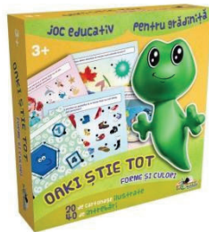
Oaki knows everything" color match puzzle animal learning mat